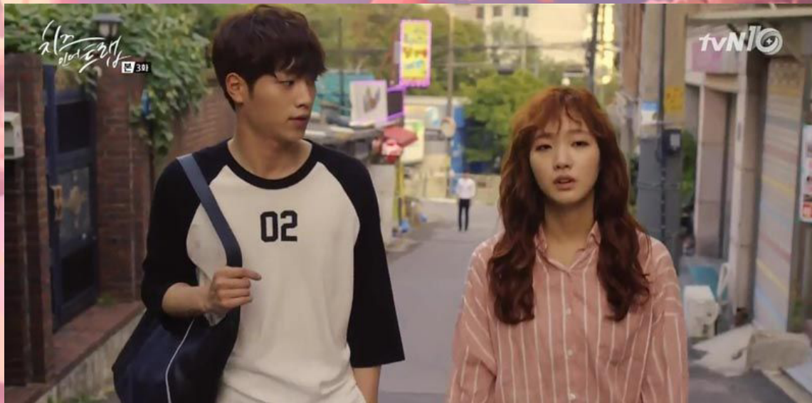
Name of the Drama: Cheese in the trap Date of release: (4 January 2016)