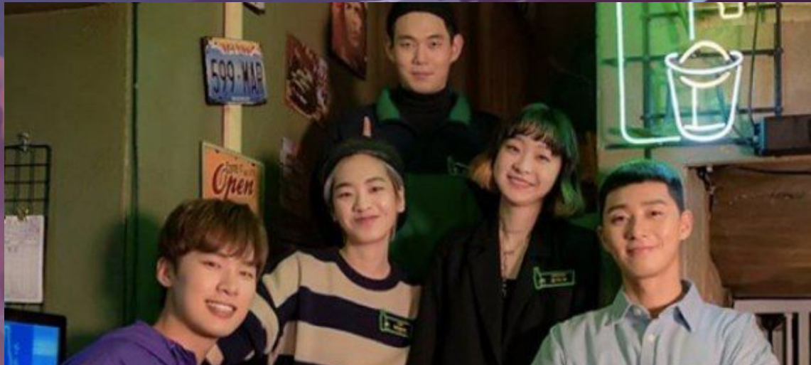
Name of the Drama: Itaewon Class Date of release of the Drama : (31 January 2020)