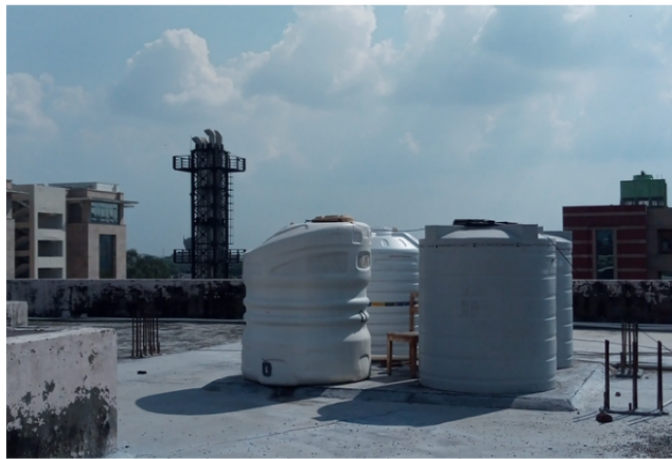
Figure 3 : Water Tanks