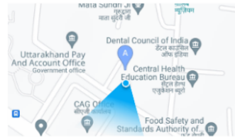
Google Map (Normal) (Zoom Level 17)