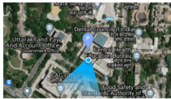
Google Map (Normal) (Zoom Level 17)