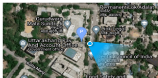
Google Map (Normal) (Zoom Level 17)