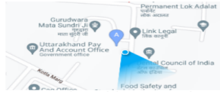
Google Map (Normal) (Zoom Level 17)