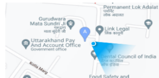
Google Map (Normal) (Zoom Level 17)