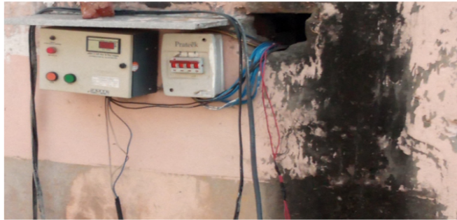
Figure 2 : Borewell