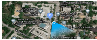
Google Map (Normal) (Zoom Level 17)