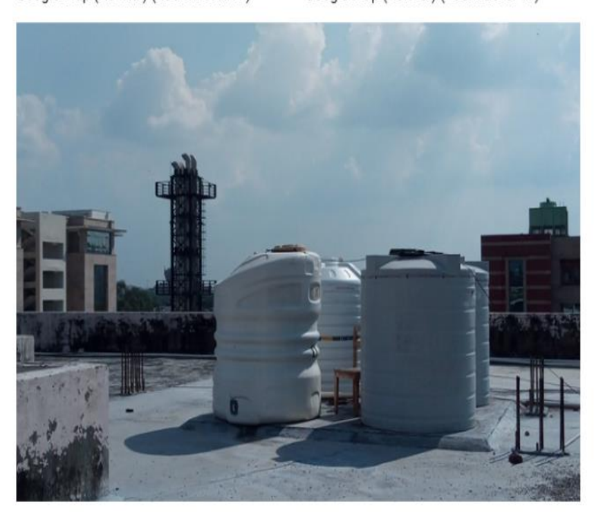
Figure 7 : Geo tagged photograph of Water Tanks