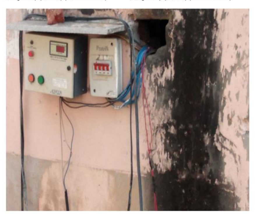
Figure 4: Borewell