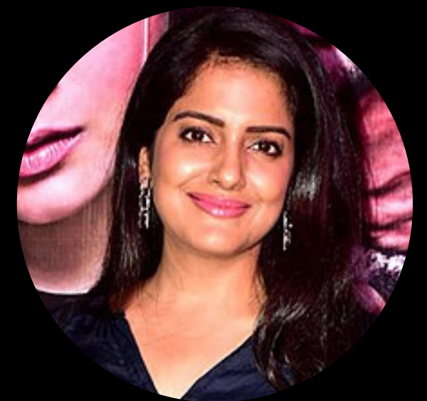
VISHAKHA SINGH Actress