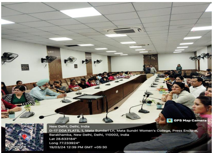
New Delhi, Delhi, India D-17 DDA FLATS, 1, Mata Sundari Ln, Mata Sundri Women's College, Press Enclave, Barakhamba, New Delhi, Delhi, 110002, India Lat 28.633184° Long 77.233924° 19/03/24 12:39 PM GMT +05:30