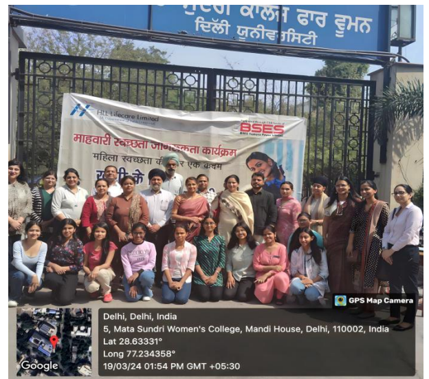
Delhi, Delhi, India 5, Mata Sundri Women's College, Mandi House, Delhi, 110002, India Lat 28.63331° Long 77.234358° 19/03/24 01:54 PM GMT +05:30