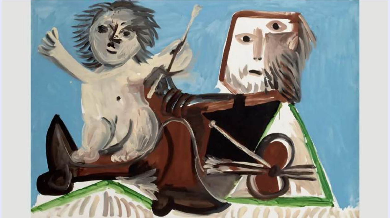
THE PAINTER AND THE CHILD (1923) by Pablo Picasso

Like many artists of the 20th century, Pablo Picasso was also obsessed with children's art. He famously said, " Every child is an artist. " This painting captures the jubilant mood and an unruly, self-consciously slapdash handling that is deliberately childlike. By the 20th century, the child, once ignored in art, had become a metaphor for the purity and intensity of the artist's vision.