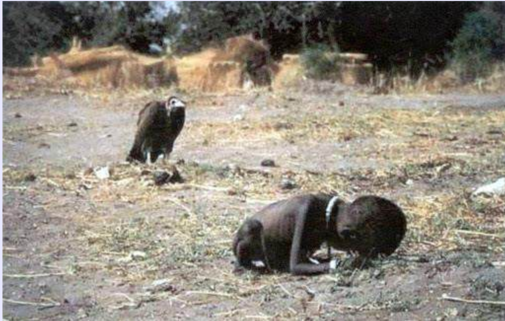
Pulitzer Prize Winning feature photography THE VULTURE AND THE LITTLE GIRL (1994) by Kevin Carter

In this picture, a young girl who was trying to make her way to a feeding centre, collapsed and a vulture landed behind her, making it seem like it was waiting for her to die. This deeply affected Kevin Carter who committed suicide a few months after winning the prize. According to the reports, the girl did survive but died fourteen years later due to Malarial fever.