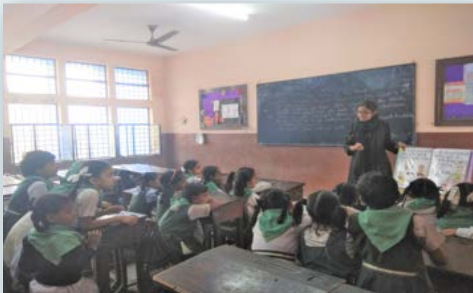
B.El.Ed Student Narrating Stories to School Children

The Department values its collaboration with the schools as it helps to connect with the community and we value learning from one another.