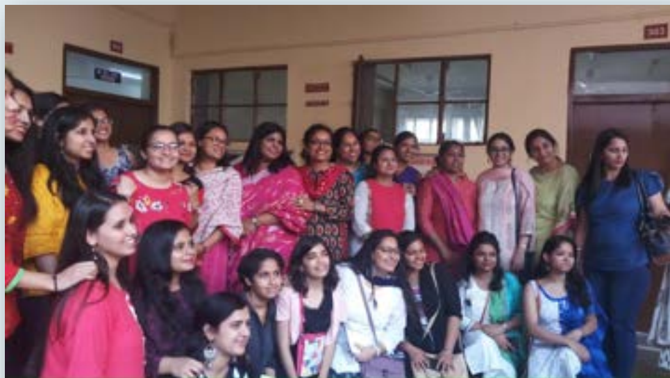
Alumni with the B.El.Ed Faculty

Social media has also been used by us to keep the alumnae well informed. They are informed about any updates on the job vacancies or eligibility rules through social media. In all, the interaction was really a memorable one.