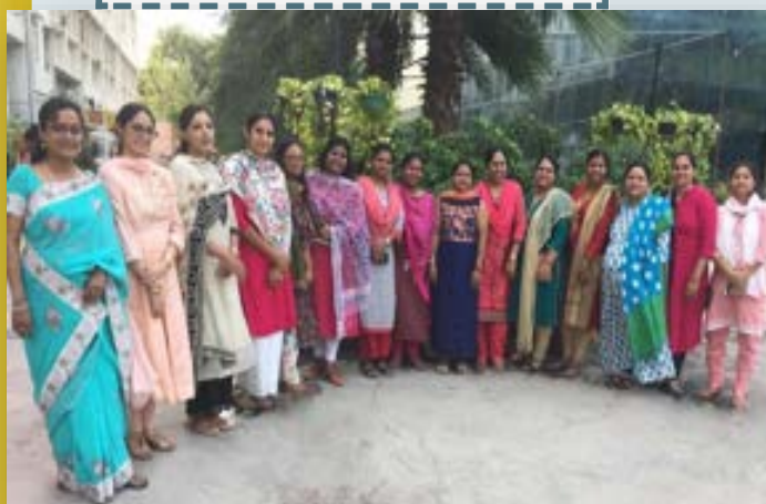
The B.El.Ed Faculty