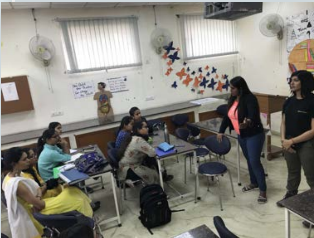
B.El.Ed IV Year Students Attending Orientation workshop on CV/Resume Writing

Many of our students from 2018-19 batch obtained campus placement in various esteemed organizations and institutions. However they will join once they complete the current academic session.