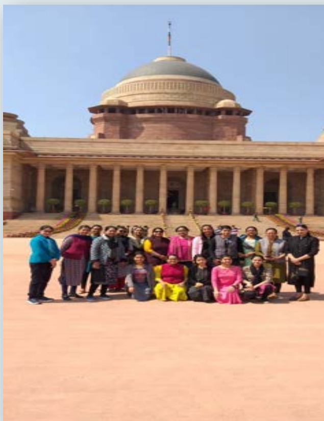
Visiting group at the Rashtrapati Bhavan