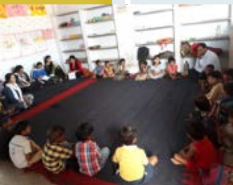
B.El.Ed Students Observing a Class at Digantar School

An innovative school visit to Digantar, Jaipur was organised by the Department for B.El.Ed. III year students in October this year. The visit is part of the practicums - 'Classroom Management' and 'Material Development and Evaluation'. The visiting group comprised of 47 students and 5 faculty members from the Department. The purpose of the visit was to closely observe and understand the innovative classroom practices of an alternative school. It was envisaged that the learners would be able to draw linkages between various pedagogy courses which they are studying and classroom practices of the innovative school.